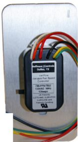
VariFlow Green Switch

Considering that the average American now spends 90% of their time inside, indoor air pollution is considered by the Environmental Protection Agency (EPA) to be a major environmental health problem. Today’s tightly sealed, energy efficient buildings and homes do keep utility costs down but seal in pollutants and pathogens which cause odor, mold and illness as well as allergies.